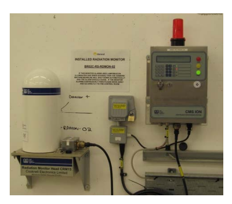
Fig 4: Installed Radiation monitor.

When the accelerators are operating and shutters open, the Optics hutches will take synchrotron radiation and bremsstrahlung. The synchrotron radiation is a high intensity beam with energy in the tens of keV range, whereas the bremsstrahlung is lower intensity but more penetrating, having an energy spectrum up to 3 GeV. Prior to taking beam, the hutches will be searched and locked by trained DLS staff. The Optics hutches are shielded with lead. Sensitive gamma radiation monitors (Fig 4) which continuously monitor and record dose rate are installed on the outer wall of the Optics hutch, opposite the first scattering element.