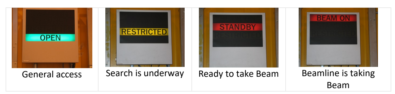
Fig 2 PSS annunciator displaying different stages in the beamline.