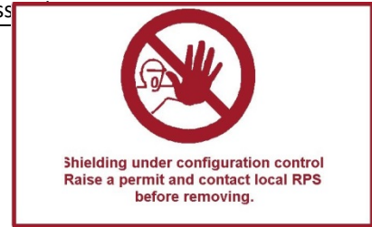
Fig 1 Sample of warning sign for PtW.

which are subject to configuration control. User labyrinths are under PSS Fortress key control rather than configuration control – the beamline is disabled if the User labyrinth key is not in its key press.