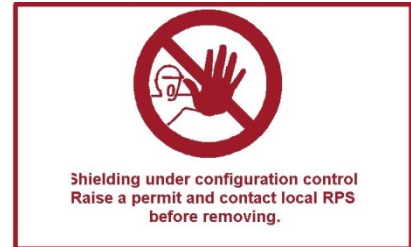
Fig 1 Sample of warning sign for PtW.

suitable signs (Fig 1) to indicate that it is subject to configuration control, and that a radiation PtW issued by the RPS is required in order to disassemble the shielding or change or remove the components. The RPS will keep a register of all shielding and components which are subject to configuration control. User labyrinths are under PSS Fortress key control rather than configuration control – the beamline is disabled if the User labyrinth key is not in its key press.