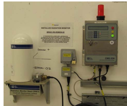
Fig 4: Installed Radiation monitor.

When the accelerators are operating and shutters open, the Optics hutches will take synchrotron radiation and bremsstrahlung. The synchrotron radiation is a high intensity beam with energy in the tens of keV range, whereas the bremsstrahlung is lower intensity but more penetrating, having an energy spectrum up to 3 GeV. Prior to taking beam, the hutches will be searched and locked by trained DLS staff. The Optics hutches are shielded with lead. Sensitive gamma radiation monitors (Fig 4) which continuously monitor and record dose rate are installed on the outer wall of the Optics hutch, opposite the first scattering element.