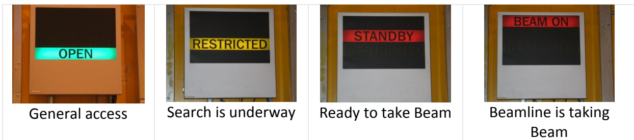
Fig 2 PSS annunciator displaying different stages in the beamline.

7.3 General access to any commissioned, operational hutch is only permitted when the annunciator outside the door reads “Open” (Fig 2). Personnel not performing a search must not attempt to enter a hutch when it is in the process of being searched, shown as “Restricted” on the annunciator. Only those personnel trained in operation of the beamline may initiate an entry to the hutch once it has been searched, shown as “Standby” or “Beam on” on the annunciator. Entries under these conditions will ‘break the search’, returning the annunciator to “Open”, and another search will be required before operation can resume.