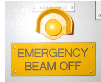
Fig 5 Emergency Beam off button.

Following sections is for information only. Emergency controller and other responsible group dealing with the incident will take following actions accordingly –